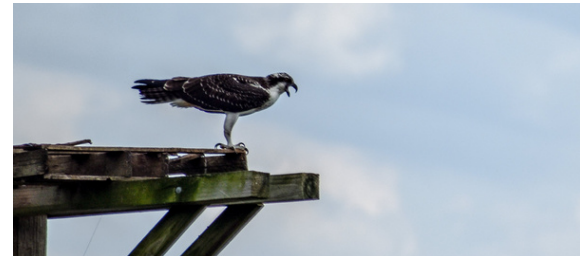
Above: Osprey seen along the Towpath Trail

Eagles are often seen along the Scioto River and on the Richards Trail. Canal Park has been fortunate to have a nesting pair of Eagles along the Richards River Trail for several years, and this year it appears that we may have a second nest being built along the same stretch of river! Eagles have made a huge comeback from the 1960's when habitat loss and the wide use of pesticides, like DDT, decimated their populations. In 1979 there were only 4 recorded nests in Ohio. In 2020, over 700 nests were recorded! Ever noticed that a section of the Richards River Trail closes from April to mid-July? This is apart of the federal protect project for the Eagles to insure that we continue to see population numbers climb.