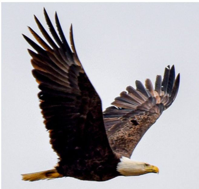
Below Left: Bald Eagle Seen on Richard River Trails Below Right: Bald Eagle Nest along Scioto River at Canal Park