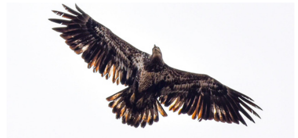
Below: Juvenile Bald Eagle seen flying around Canal Park