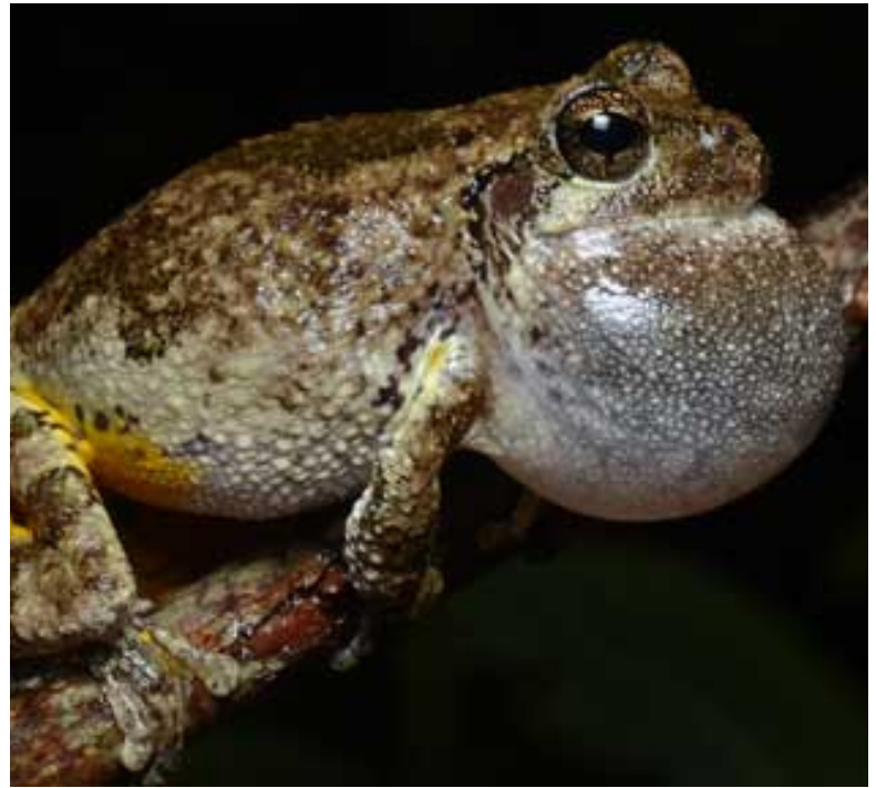
Above: Gray tree Frog

Frogs are amphibians, they have moist skin and are associated with water. There are two groups of amphibians, frogs and toads who have not tails and salamanders who do have tails. They are indicators of a clean water environment, so enjoy their songs as a small proof of a cleaner world.