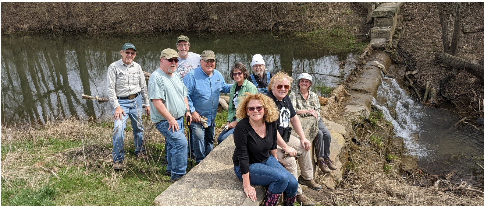
Below: Volunteers on WPA Dam after a trash removal day.