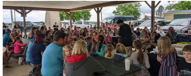
Below: Library Presentation at Canal Park