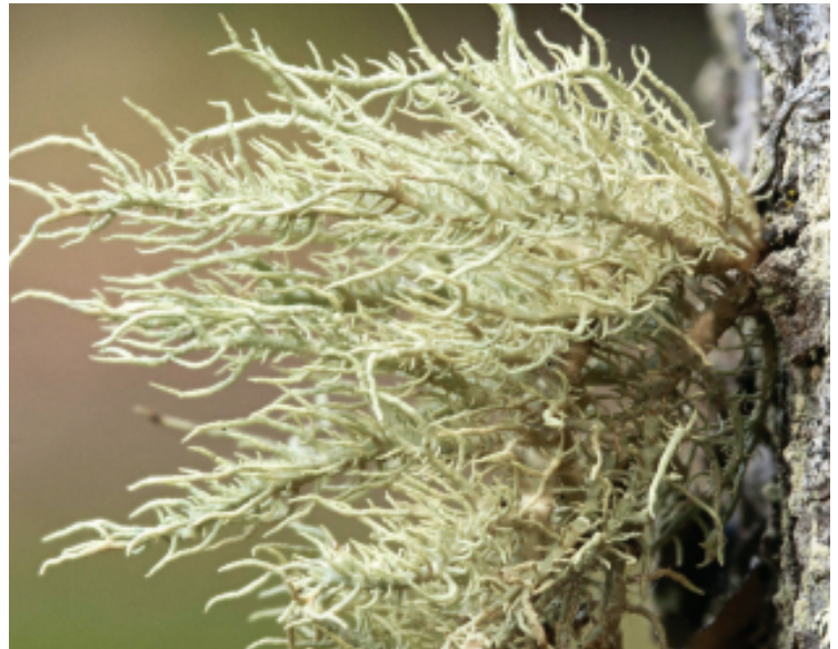
Above: Photo of Bushy Beard Lichen from ODNR Lichen ID Booklet

Lichen is one of the most widely distributed entities in the world with approximately 3,600 species that we know of in North America. Lichen is complex and are actually two separate organisms that have joined together in a symbiotic partnership. The dominate partner is fungus, which is where the lichen gets most of its features and the other is alga. Either green alga, blue-green alga or sometimes both. These algae are also referred to as cyanobacteria. Fungi are a diverse group in their own kingdoms, that do not contain chlorophyll and so they rely on other organism for nutrients. The lichen partnership provides these nutrients for the fungi. The algae photosynthesize and provides the food. The algae are from their own kingdom, Protista, which is separate from the plant and fungi kingdoms. They are a part of the bacteria kingdom. Lichens are often confused with moss which are in fact plants and completely unrelated to the lichen. Although mosses are primitive, unlike lichen they have plant-like structures, have chloroplast, and have roots and stems. Though there are many benefits of lichens, one direct benefit to our planet is their ability to absorb toxins and pollutants from our atmosphere. Scientists can extract these toxins to determine levels of heavy metal, carbon, sulfur in our air. This provides helpful insights into the health of our planet.