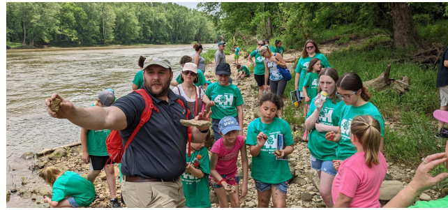
Above: Geology Program lead by ODNR Geological Survey

Keep an eye out for future invasive removal events and other activities going on at the park by signing up to be a volunteer on our website. Click here for more information and here for our calendar of events.