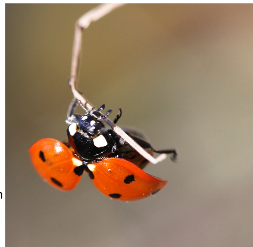
Above: Seven-spotted Lady Beetle ( Coccinella septempunctata )

These quintessential insects of summer are most active on sunny days from spring until fall. Remember the Old Farmers' Almanac adage, "When ladybugs swarm, expect a day that's warm." When the weather turns cold, they look for warm places, such as rotting logs and leaves, under rocks, or inside houses. Hibernating colonies can contain thousands of these universally beloved insects that many cultures regard as symbols of good luck.