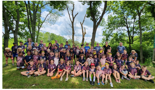
Above: Campers and Volunteers from EE Camp

Looking for ways to get involved in park activities? Visit our website or contact Arista Hartzler at ahartzler@pickawaycountyohio.gov for more information.